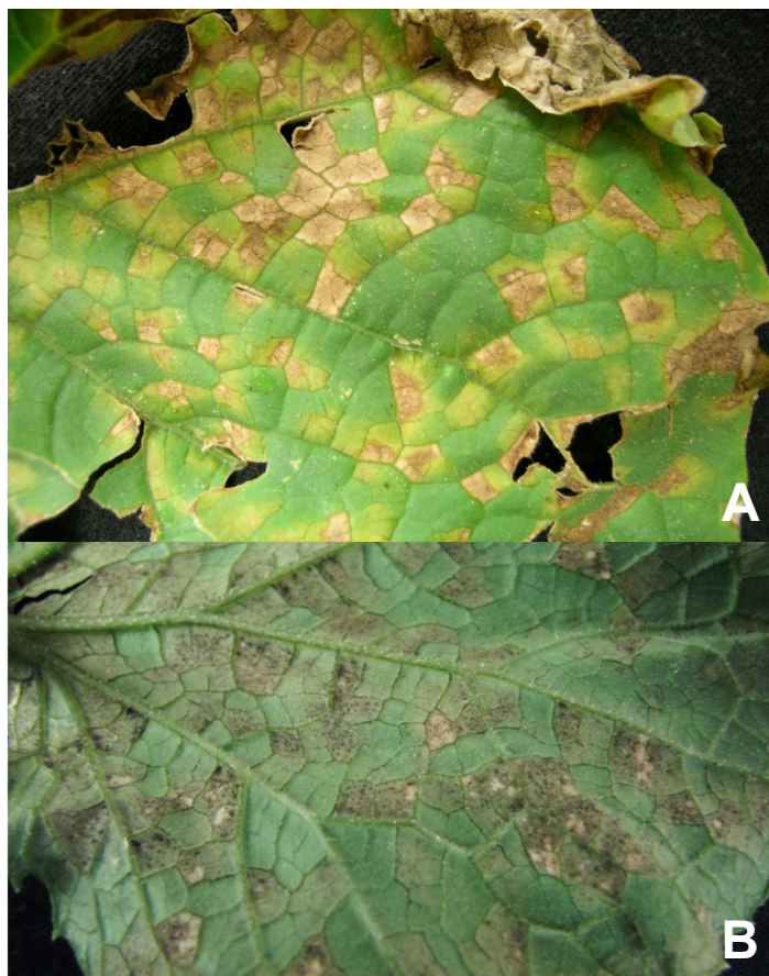
Figure 1. A. Top side of cucumber leaf with yellow lesions and necrosis defined by the veins. B. Underside of cucumber leaf displaying dark fuzzy spore masses.

To help achieve early detection of airborne spores, volumetric spore traps (Fig. 2A) have been placed in Michigan counties during the growing season. Spore traps continuously sample the air and collect spores by imbedding them on a film that is removed