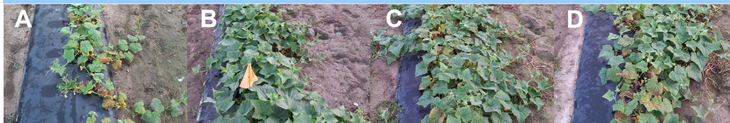
Figure 3. DM on A, untreated cucumber, and plants treated with B, Orondis, C, Previcur Flex, and D, Elumin

The Hausbeck Lab continues to evaluate new and existing products annually to determine the most effective fungicide products available for DM control (Fig. 3A-D). Research has found that the DM pathogen may be resistant to fungicides that were once extremely effective.